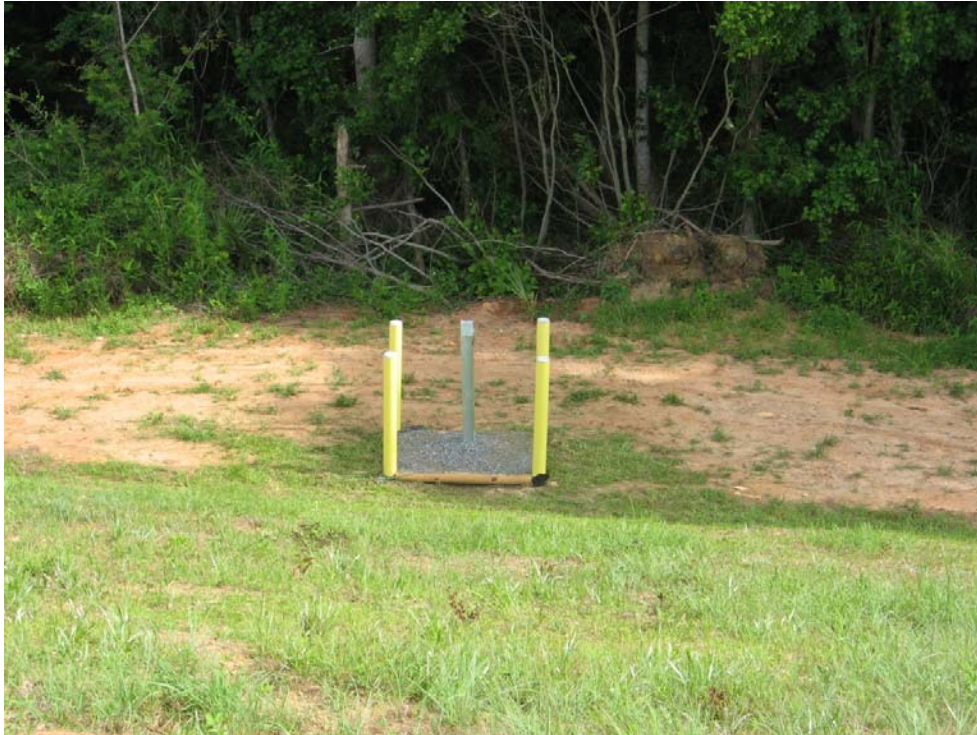
PHOTOGRAPH 9 GROUNDWATER MONITORING WELL ON NORTH TOE OF DAM