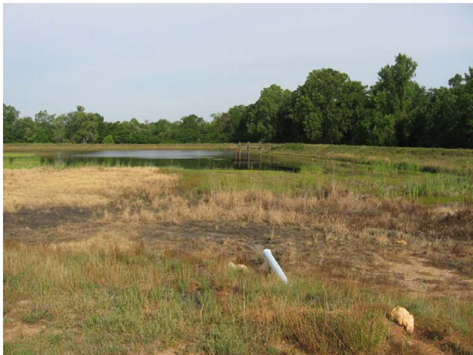
PHOTOGRAPH 4 CCW SLUICE DISCHARGE AT EAST EMBANKMENT (PVC PIPE)