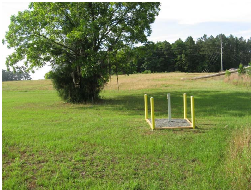
PHOTOGRAPH 10 GROUNDWATER MONITORING LEVEL UPSTREAM OF ASH POND