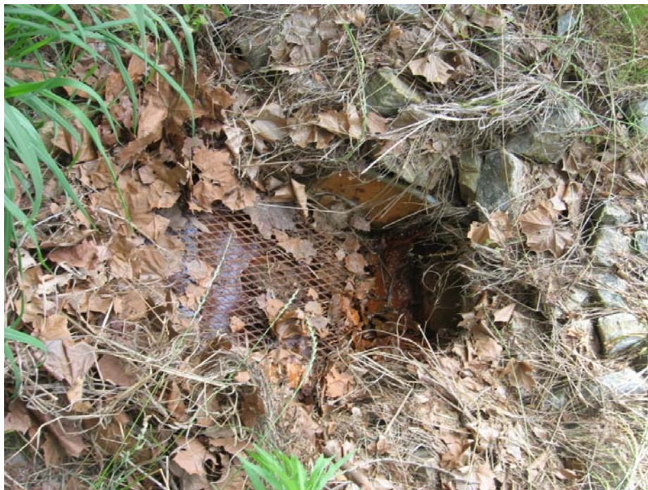
PHOTOGRAPH 6 PRINCIPAL SPILLWAY EXIT BASIN – OPEN EXIT CHANNEL AND REMOVE TRASH DOWNSTREAM