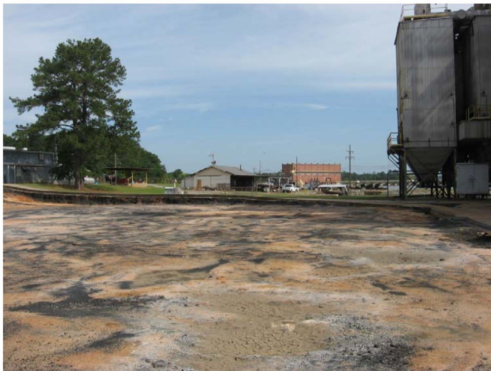
PHOTOGRAPH 2 OLD COAL STORAGE AREA LOOKING NORTH TOWARD HYDRO PLANT