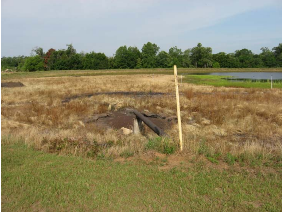
PHOTOGRAPH 3 CCW SLUICE DISCHARGE AT EAST EMBANKMENT (CAST IRON PIPE)