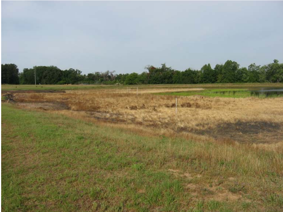
PHOTOGRAPH 7 ASH POND LOOKING WEST