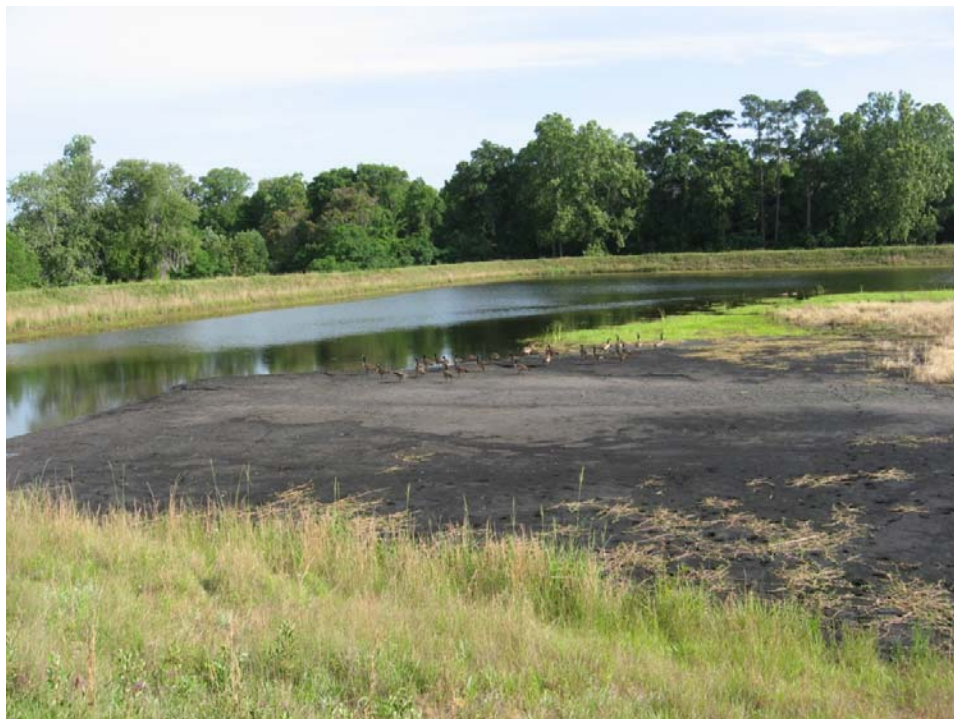
PHOTOGRAPH 8 FROM SOUTH LOOKING TOWARD NORTH AND WEST EMBANKMENTS