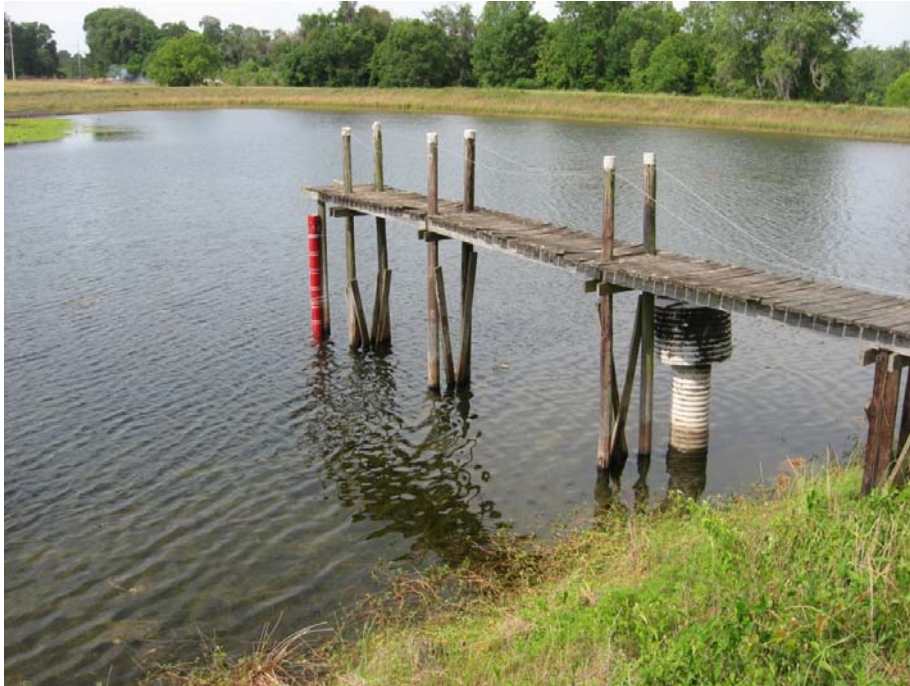
PHOTOGRAPH 5 PRINCIPAL SPILLWAY INTAKE RISER – WATER LEVEL APPROXIMATELY 8 FEET BELOW DECK