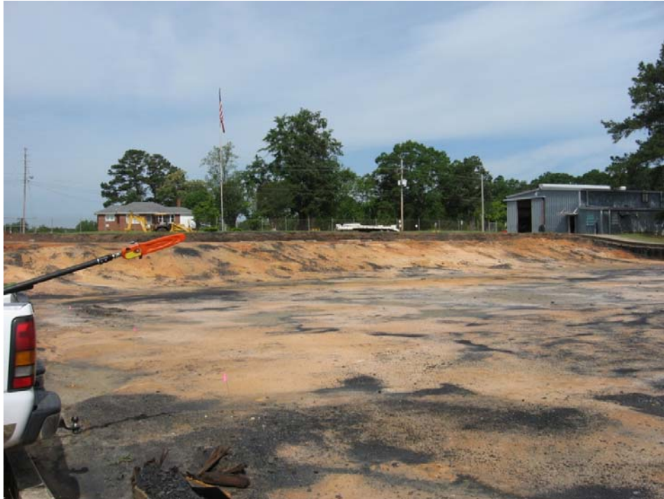
PHOTOGRAPH 1 OLD COAL STORAGE AREA LOOKING WEST TOWARD PONDS